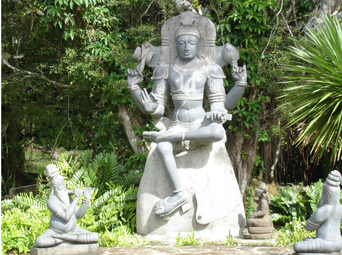
Dakshinamurthy is an aspect of Siva as Guru with all kinds of knowledge.