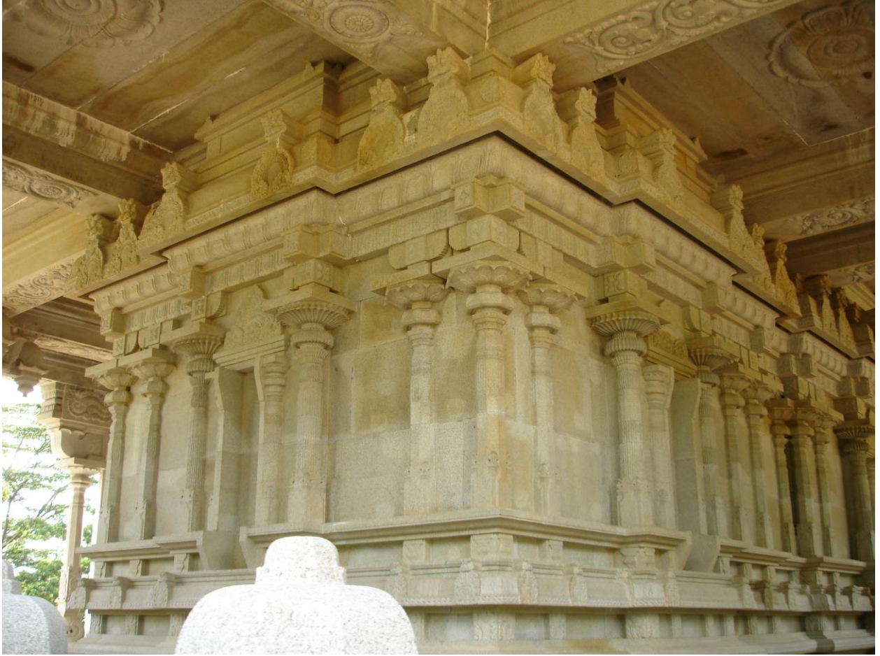
An ornate look of one corner of the Iraivan Temple (இறைவன் கோயில்).