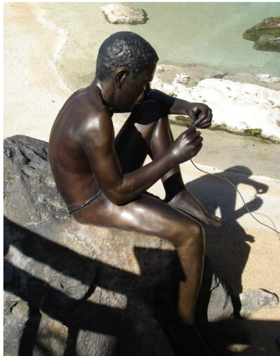
Rows of trees. The boy repairing the fishing nylon thread.