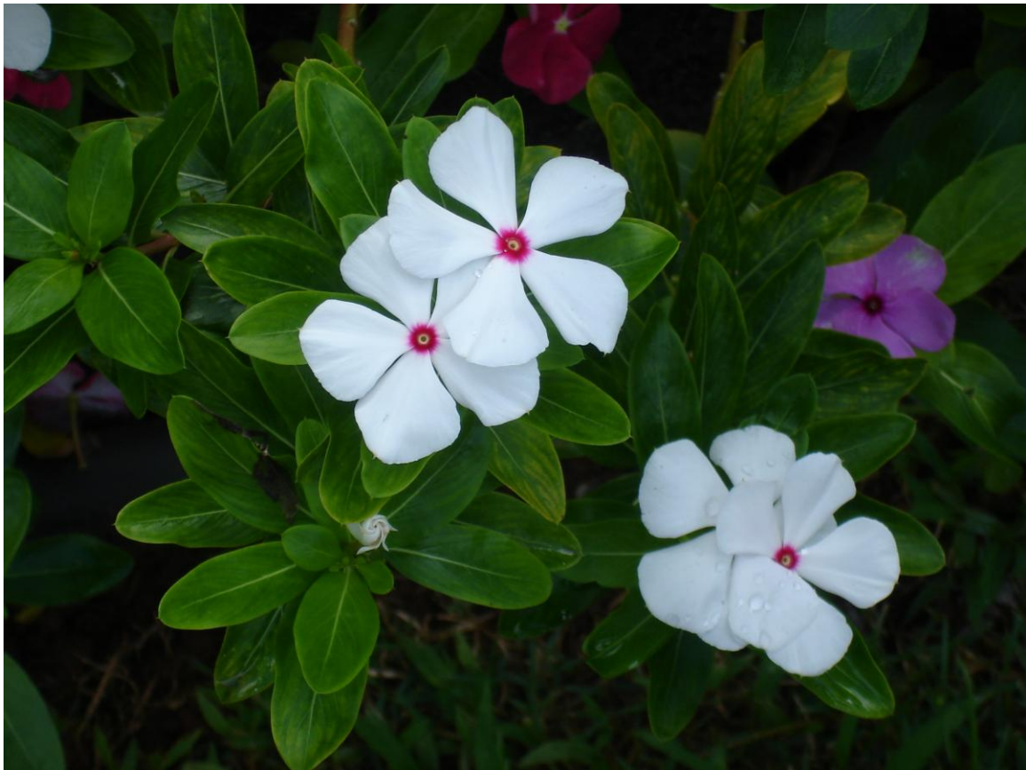
The tree with five petal flowers. Name?