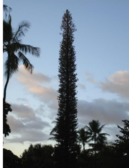
Waimea Plantation Cottages grounds: a common site for weddings.