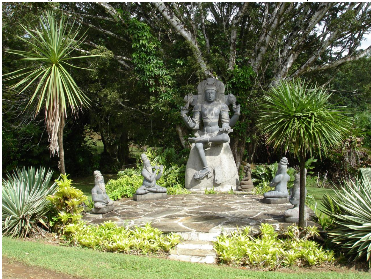
Behind the temple under construction is Dakshinamurthy with his disciples. All statues and temple Structures are carved in stone in South India and transported to Kauai for assembly by Indian artisans.