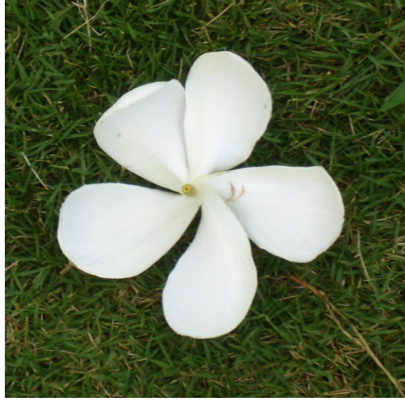
Five Petal flower. Name?