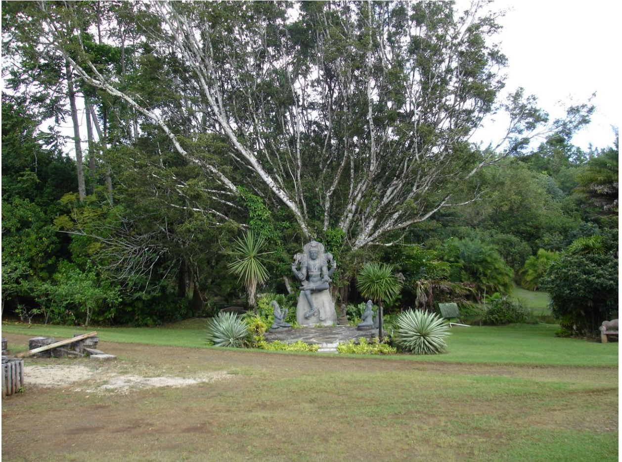
Dakshinamurthy under a tree.