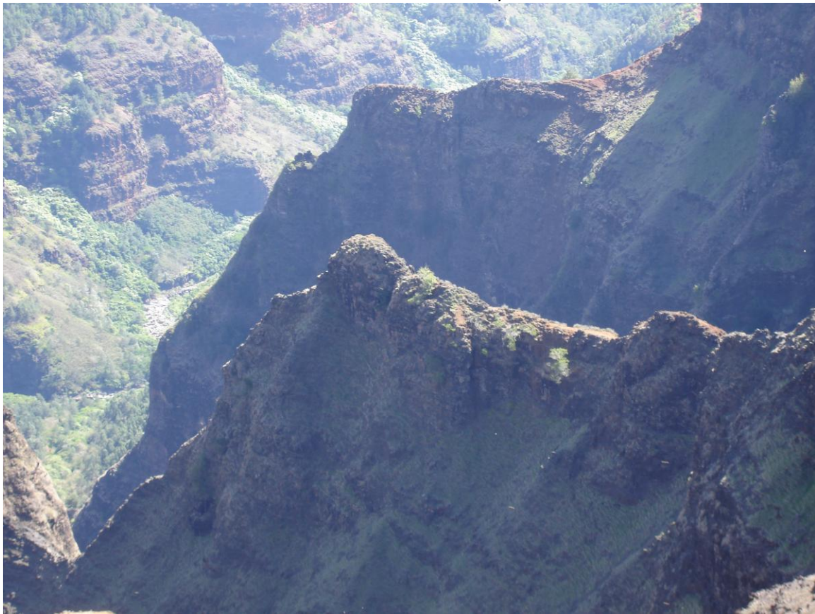
Waimea Canyon, rugged beauty.