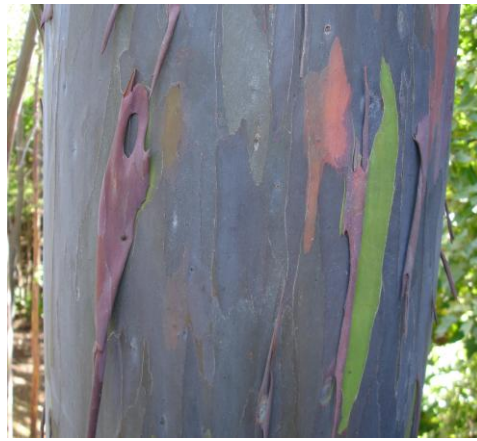
Rows of trees. Exquisite variegated colors of tree trunk.