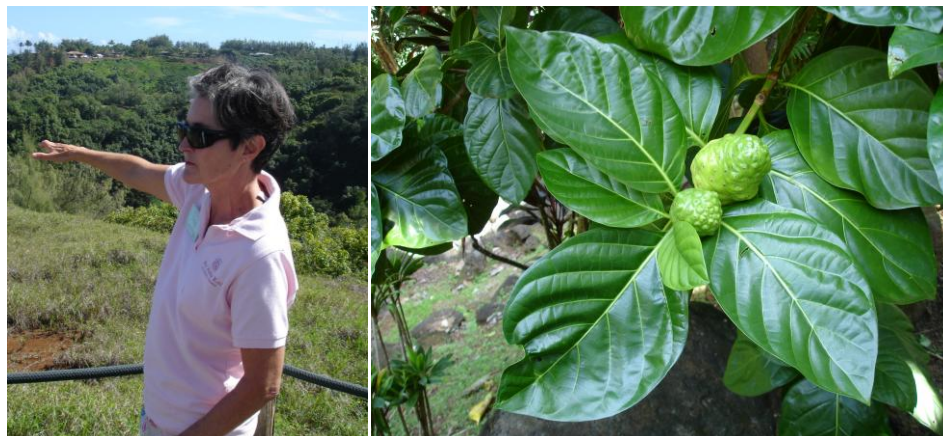
The guide in the Botanical Gardens of Na 'Āina Kai. Noni Fruit, marketed as drink.

Photos by Veeraswamy Krishnaraj on a tour of the Botanical Gardens with the guide and seven others in November 15, 2011 in the Island of Kauai.