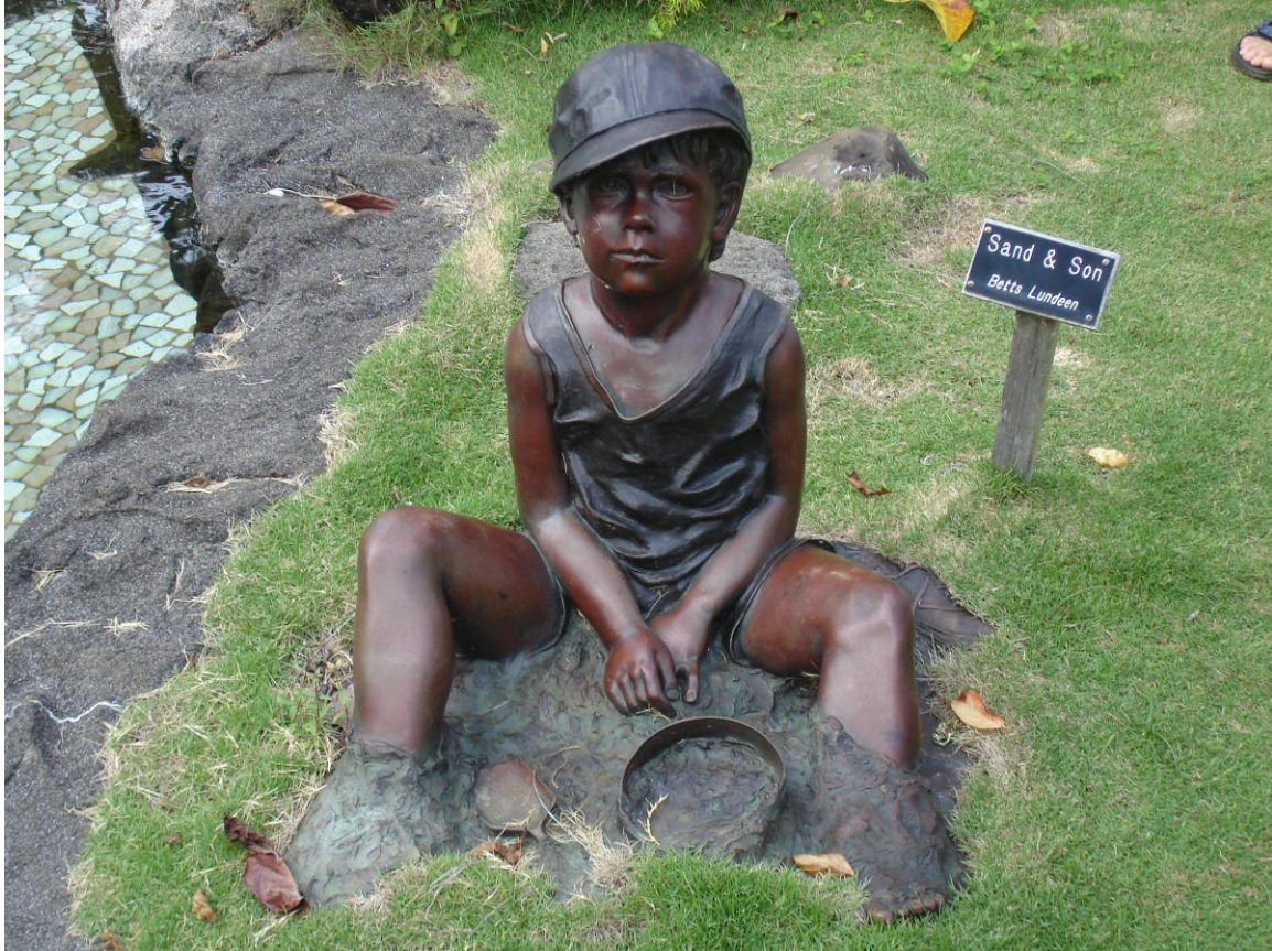
The boy playing in the sun and sand (mud).