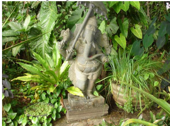
On the way to Iraivan Temple. The statue of Ganesa. The Lord of beginnings and the first son of Siva and