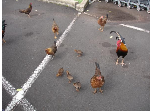
The feral chickens on the parking lot of Walmart store in Kauai.