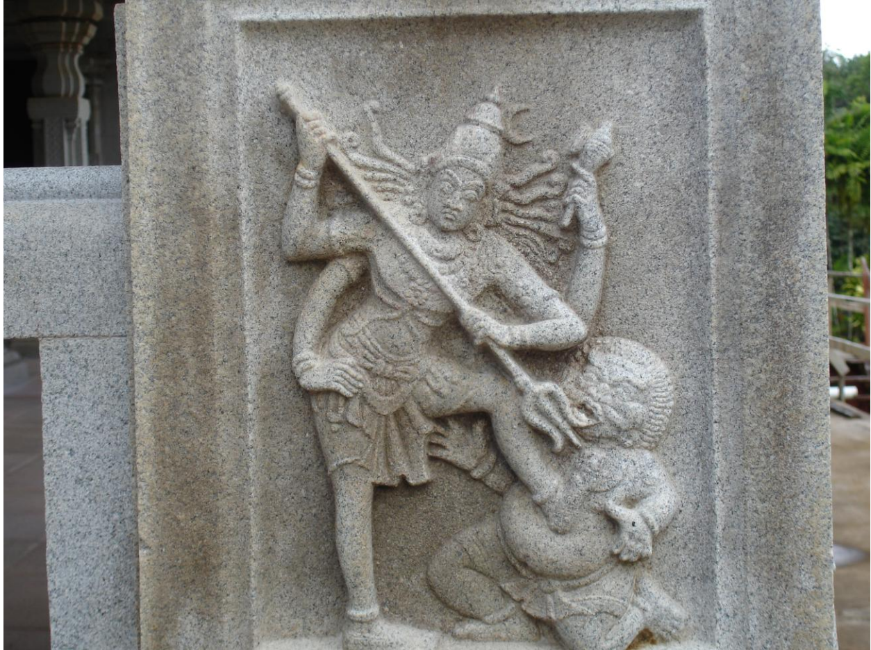
Siva kills the demon, a symbol for evil in men.