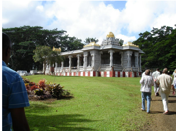
Himalayan Academy Iraivan Temple under construction in Kauai.

The 353-acre sanctuary on this tropical isle is a theological seminary, publishing center, home of Iraivan Siva temple, and a destination for Hindus who come on pilgrimage from around the world.