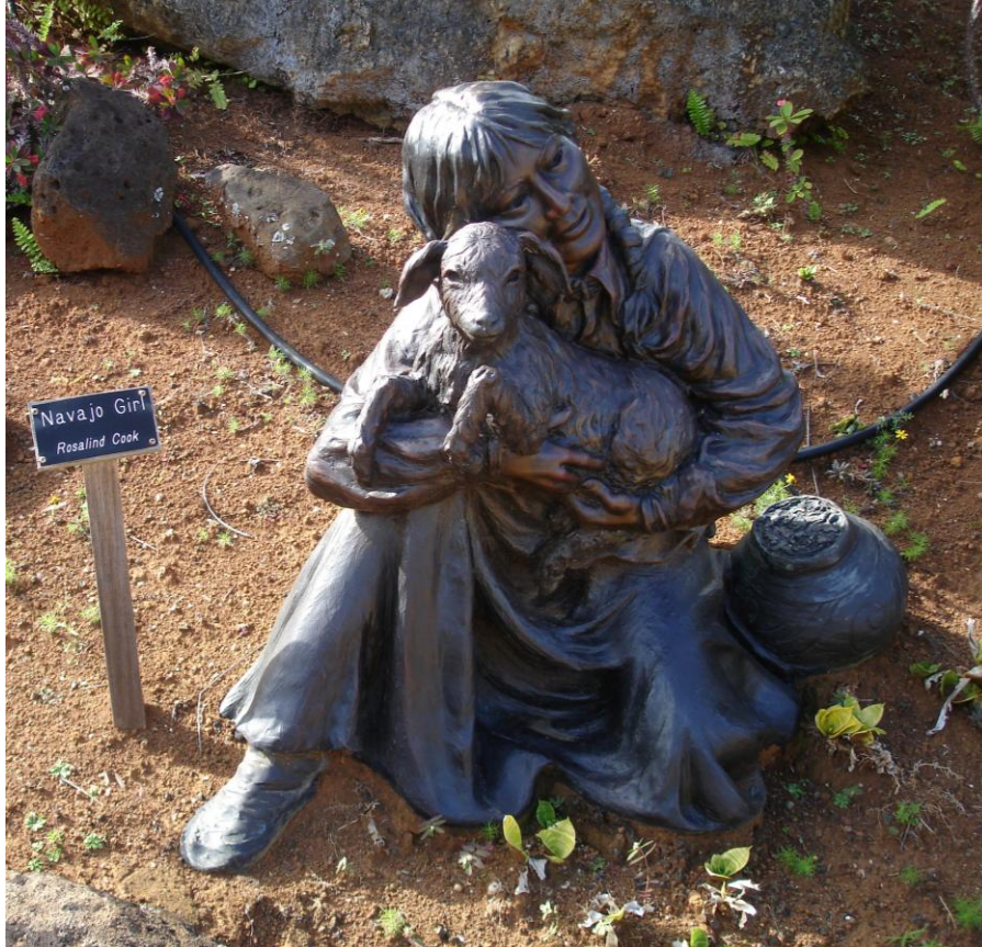
Navajo girl with a lamb.