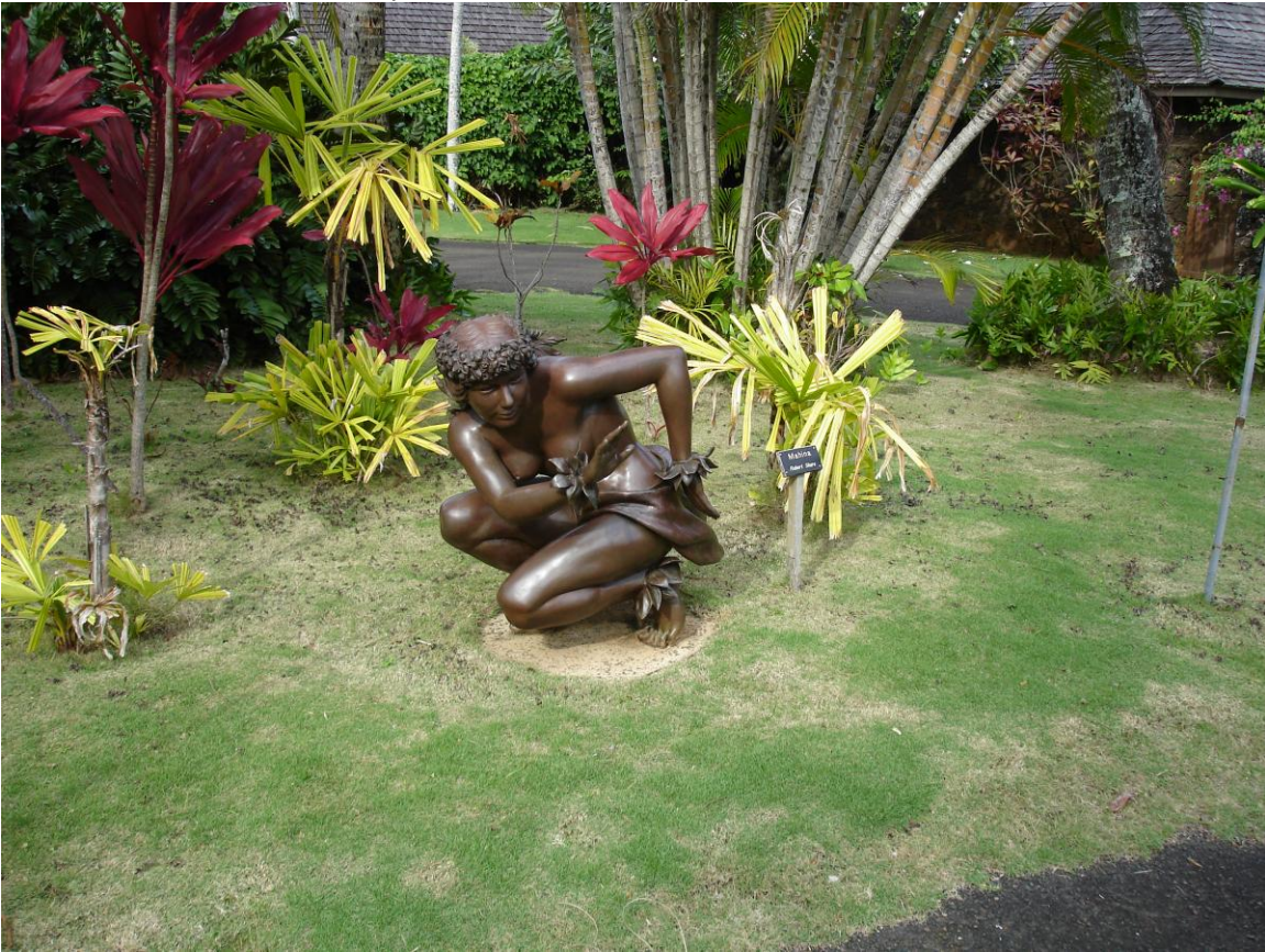
A girl with floral and leaf decorations on the head, wrists and ankles.