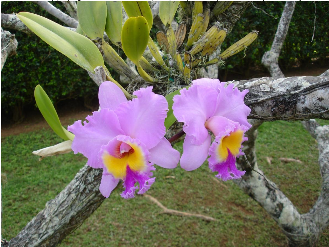
Twin flowers. Name?