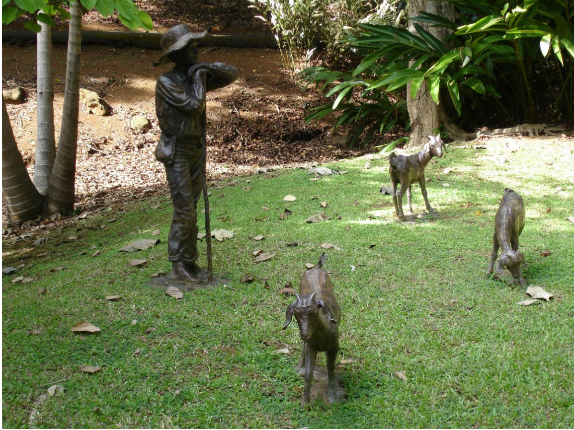
The Shepherd boy tending the goats.