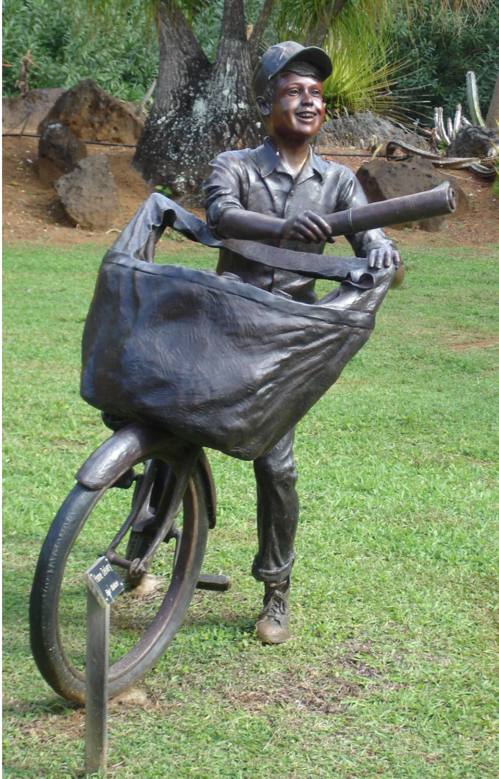
Boy delivering newspaper.