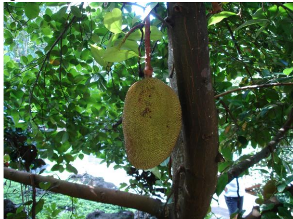
A view of the ocean and the edible Jack Fruit of the tropics in the gardens.