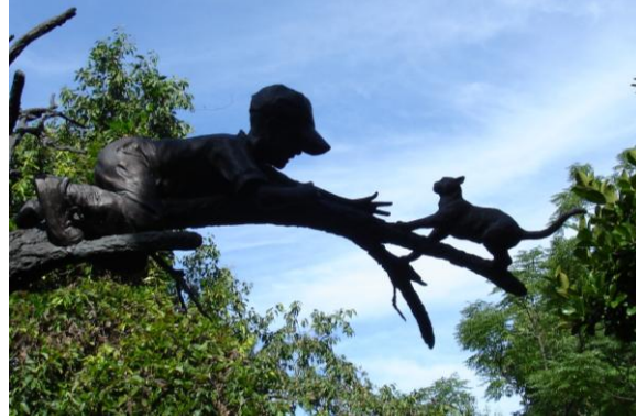
Awe and Wonder. Boy tries to retrieve the cat on the tree.