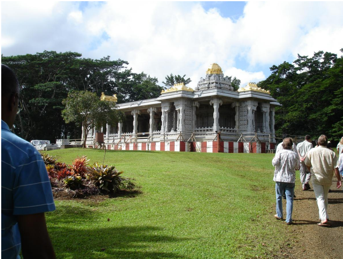
Our group proceed to the Iraivan Temple under construction on 11-12-2011. In the background are the Rudraksha trees, whose nuts are worn around the neck by Siva Devotees.