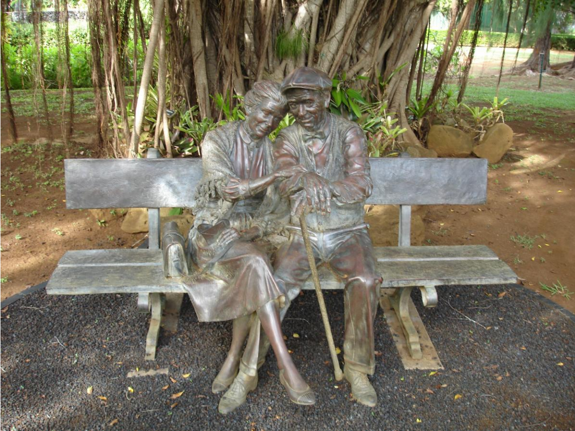
Tryst under a tree and a private moment.