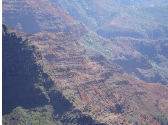
One view of Waimea Canyon.