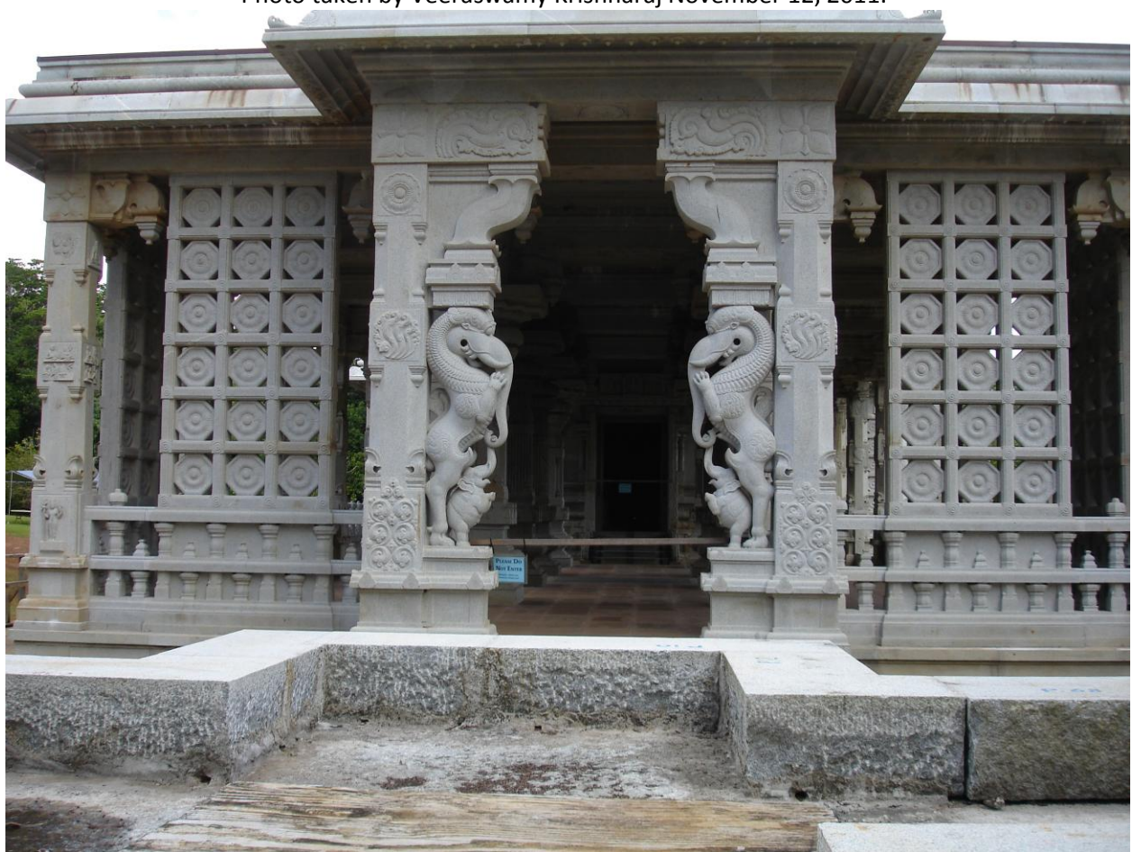
The front of the temple guarded by mythical beings.