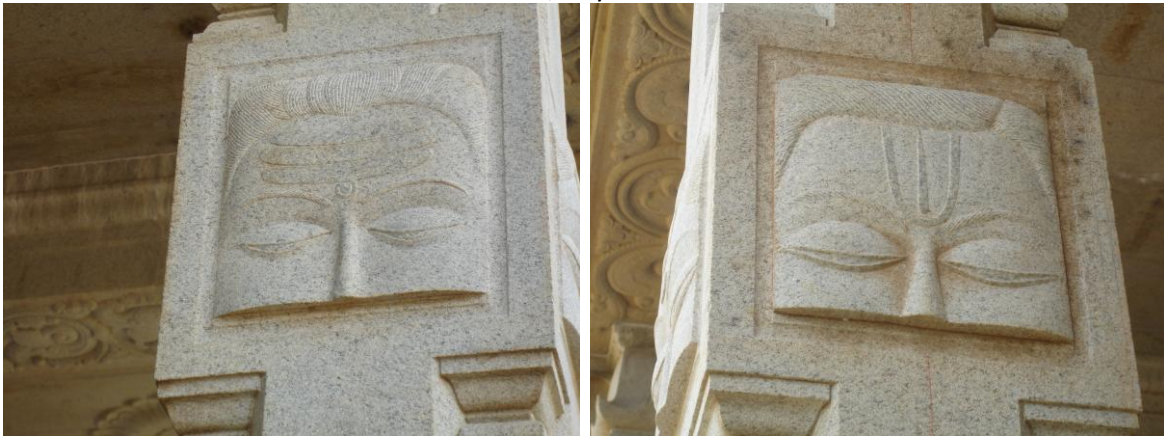
A portrayal of Saivite and Vishnavite. See the Sectarian Marks on their foreheads.