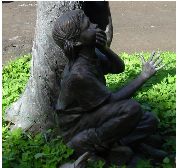
Bronze sculptures of tree and children. Awe and wonder.